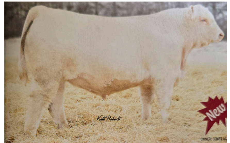
LT NATIONWIDE 8455 PLD