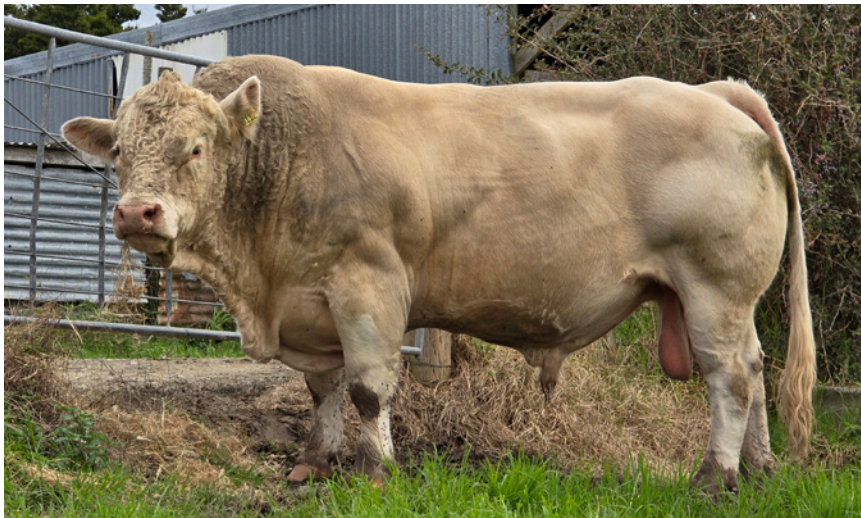
SASMO S112 SON OF DALMAS CASINO 375C P