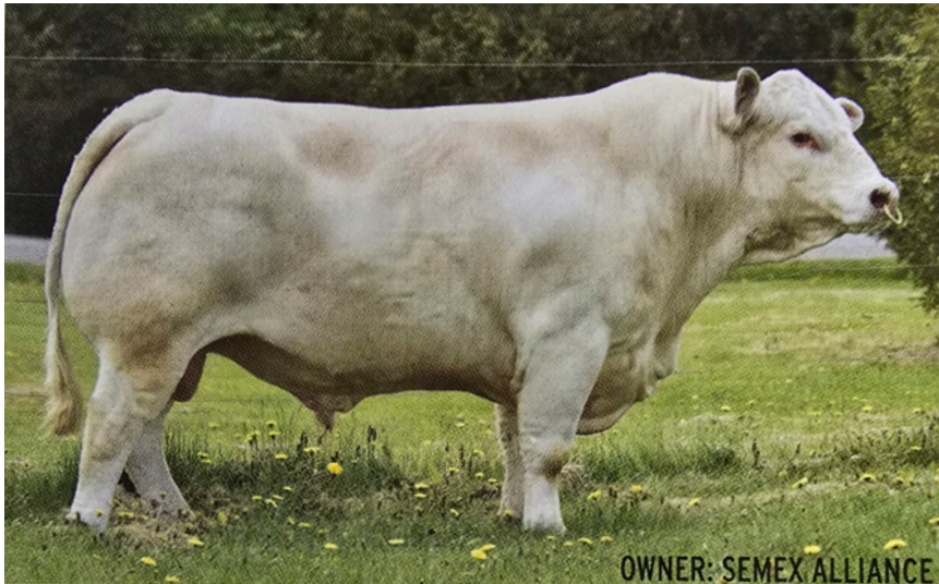
DALMAS CASINO 375C (P) FULL FRENCH PEDIGREE