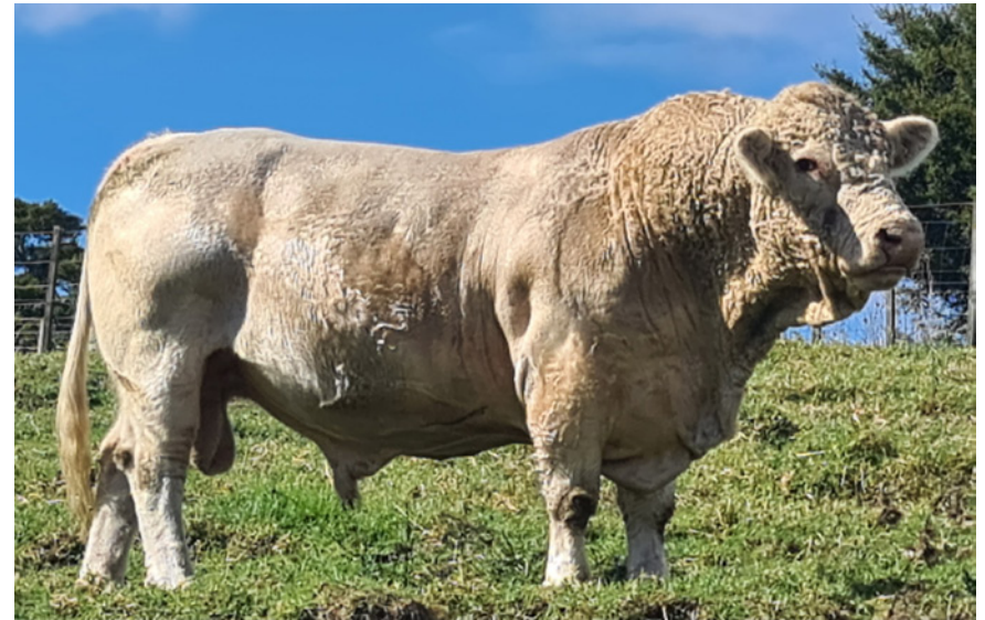
CF P102 PYBOLIN. SON OF SYMBOL